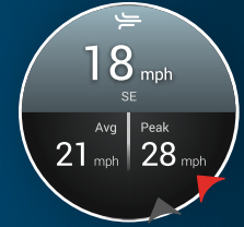
Wind Speed / Direction